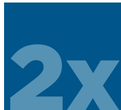
ForeCare Standard Approval