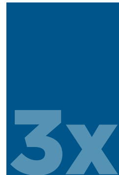
ForeCare Premier Approval